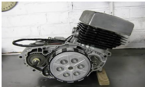
Figure.2. 2 stroke petrol Engine

Figure.2, represents the two stroke petrol engine used in the experiment. Pneumatic cylinder is used to operate the brake lever (Figure.3).