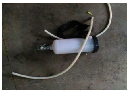
Figure.1. Fuel Tank

Two stroke engines completes the full cycle in every two stroke movement of the piston. Where as in four stroke engine piston travels four strokes. Stroke length represents the distance covered when piston moves from top to bottom dead centre or bottom to top. In the proposed model two stroke petrol engine is used. Fuel tank is shown in the figure.1.