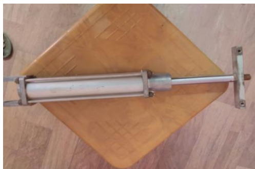
Figure.3. Pneumatic cylinder

Figure.2, represents the two stroke petrol engine used in the experiment. Pneumatic cylinder is used to operate the brake lever (Figure.3).